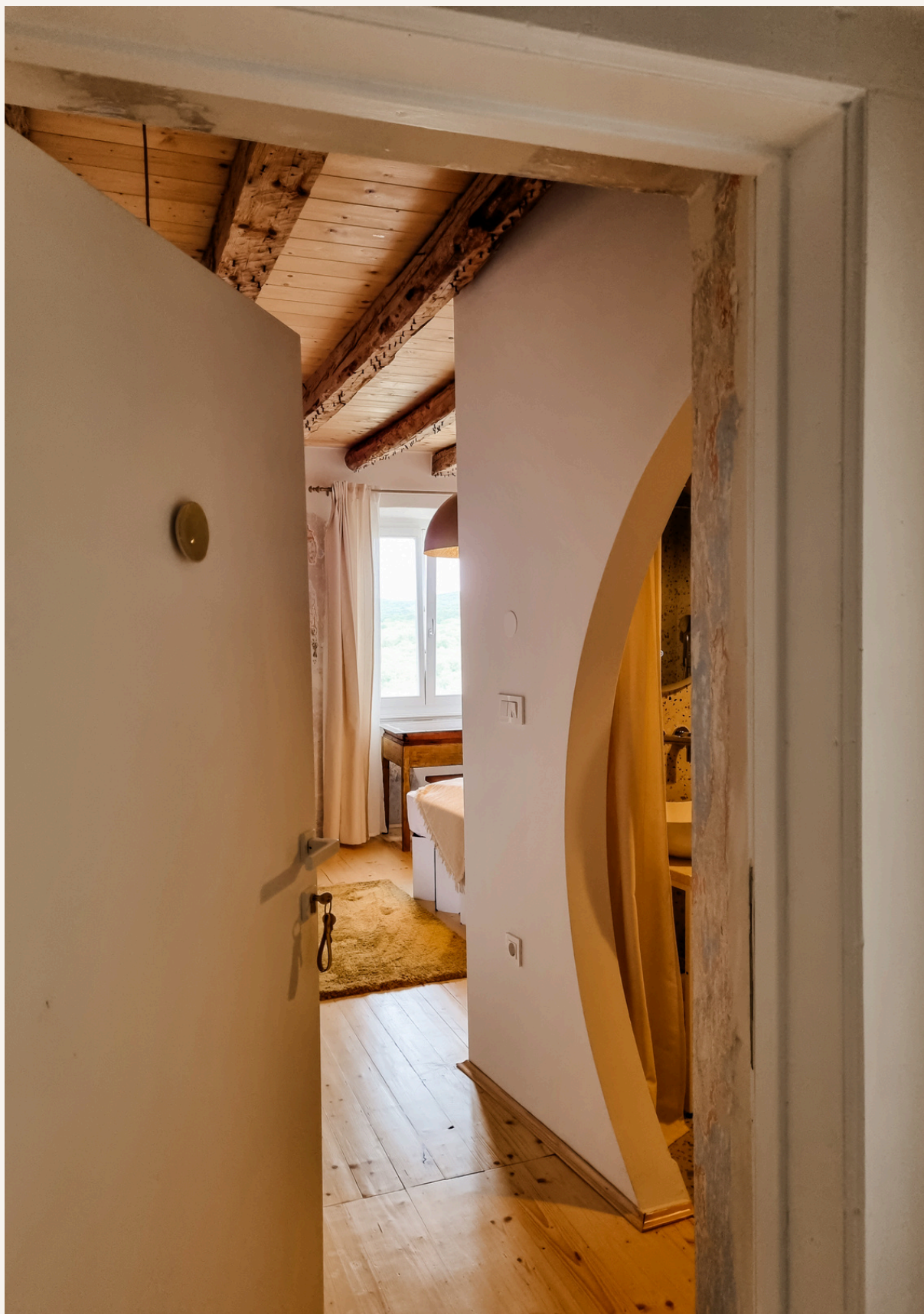
Villa Porta no Bale-Valle, Istria, Croatia